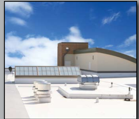
ChemGuard delivers high performance protection to any industrial building, even in harsh environments.